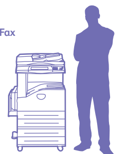
WorkCentre 5222 with two-tray module